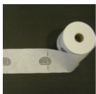
ARDEX SK-12 Crack bridging / junction tape