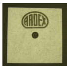
ARDEX SK-W 120mm x 120mm pipe collar (Approx. 14mm diameter hole)