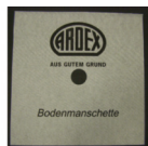
ARDEX SK-F 425 x 425mm pipe collar (Approx. 50mm diameter hole)