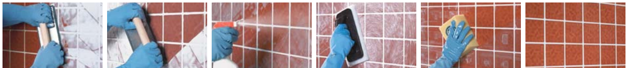
ARDEX WA: Application