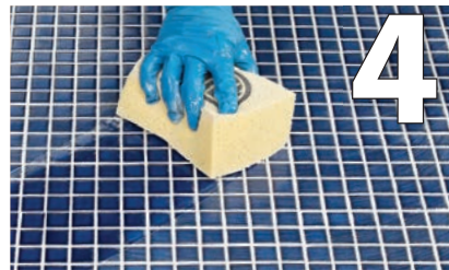
Clean down the tile surface to remove emulsified residues