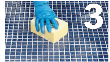
Wash any residue off the face of the tiles when slightly hardened in the joints, and up to 60 minutes after application