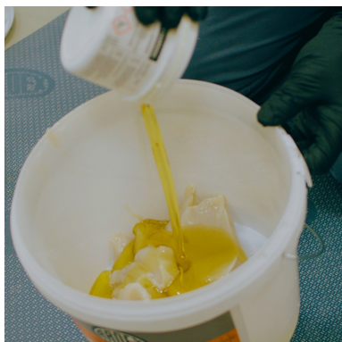
Mix the resin and hardener together