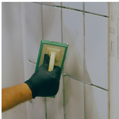
Apply ARDEX EG 18 PLUS with a hard rubber grout float