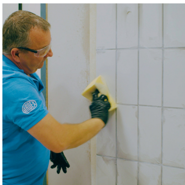
Clean down the tile surface to remove emulsified residues