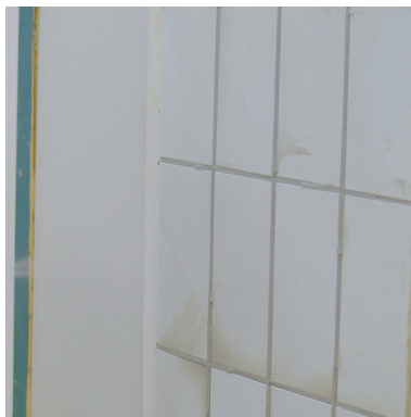
When ready to wash off, spray a fine mist of water over the face of the tile