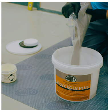
Mix in the filler